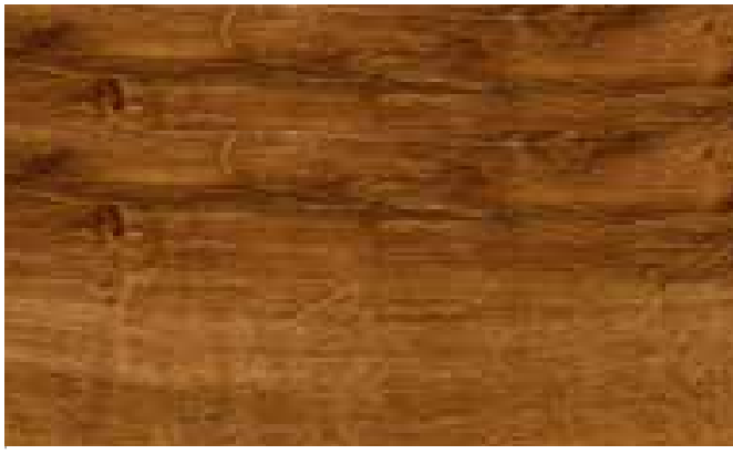
⇒ English Oak