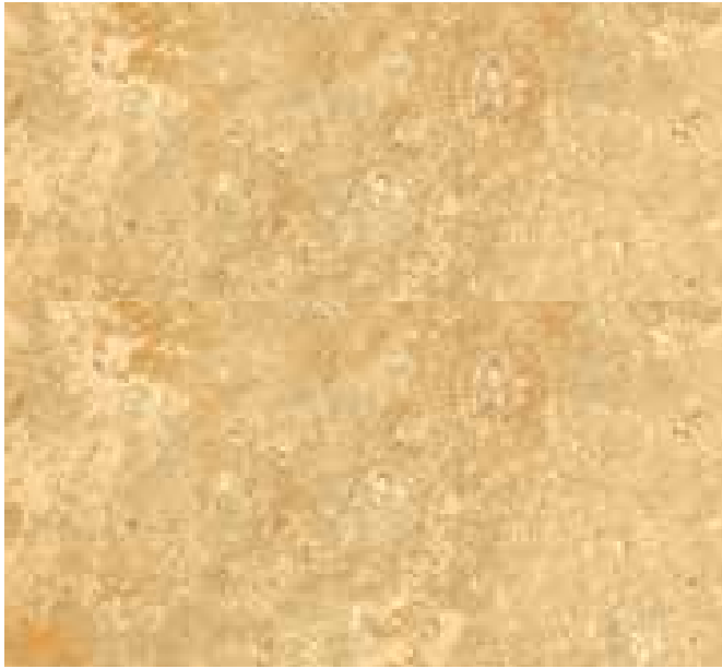
⇒ Sand Stone