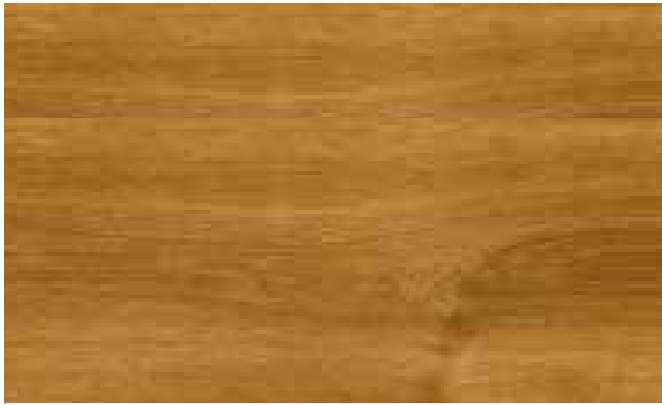
⇒ Burnt Oak