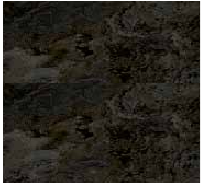
⇒ Riven Slate