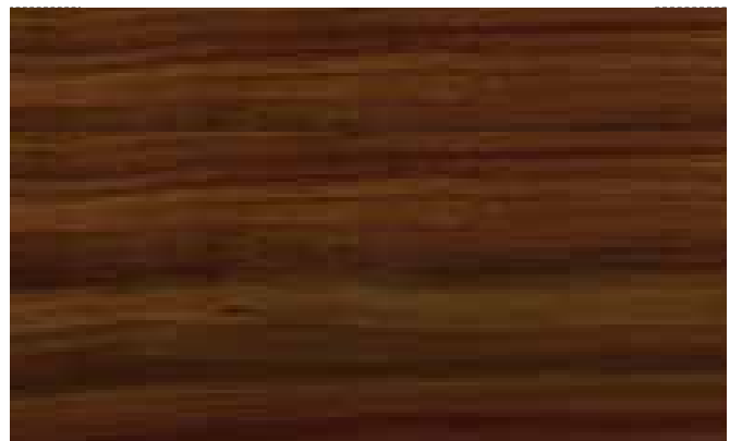
⇒ Rich Walnut