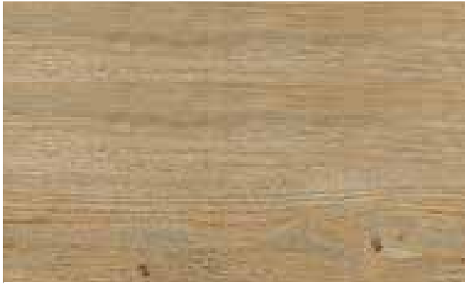
⇒ Weathered Oak