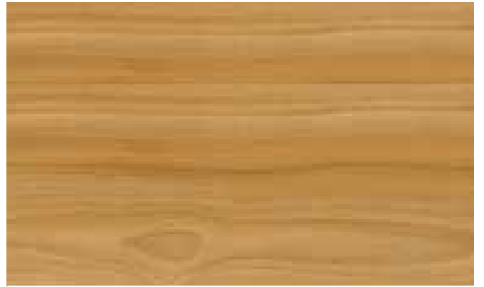
⇒ Oriental Beech