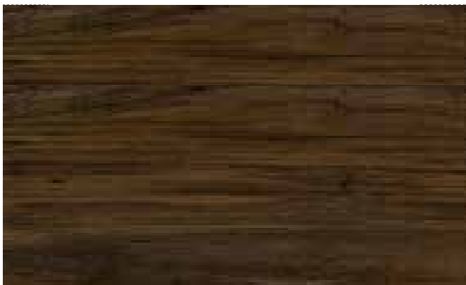
⇒ Barn Oak