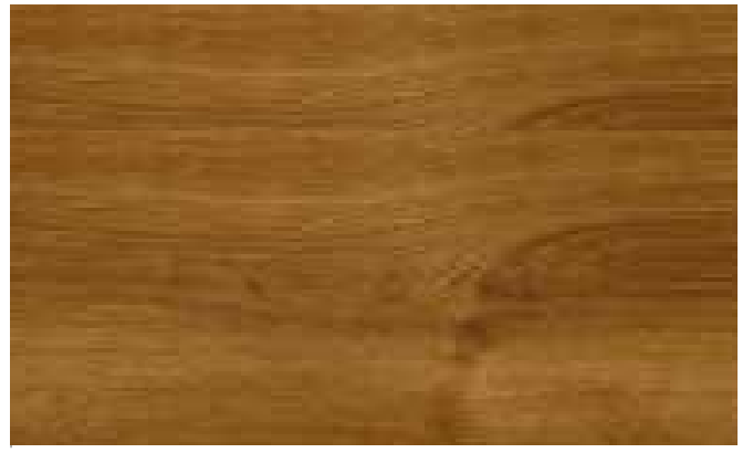
⇒ Summer Oak