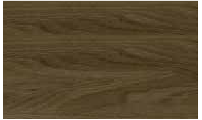
⇒ Casablanca Oak